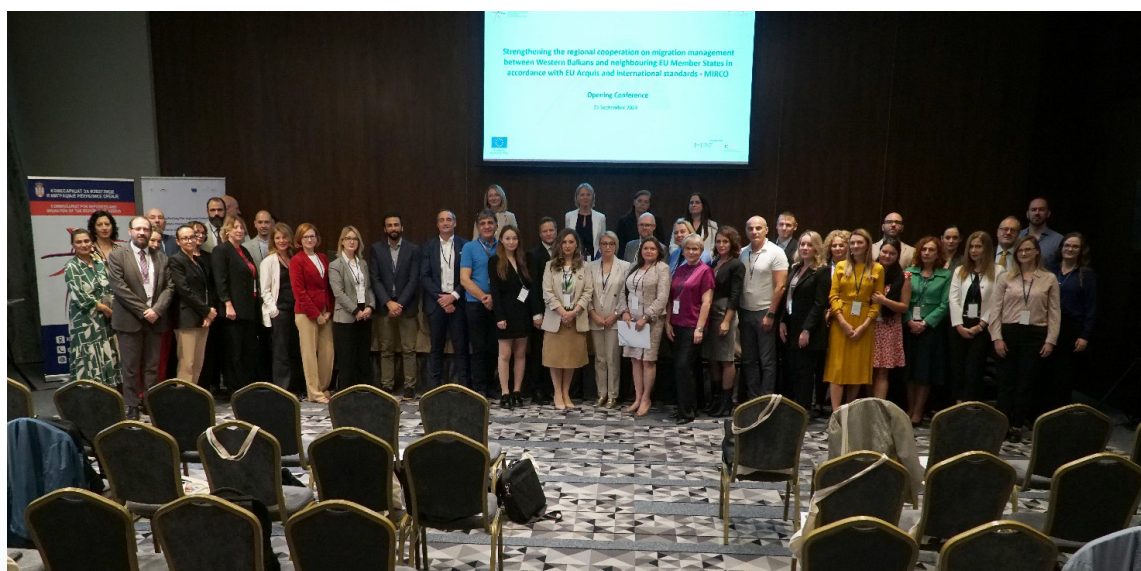
Activity Spotlight – Opening Conference