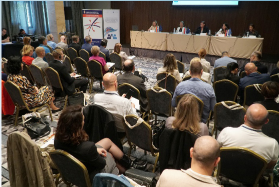
Activity Spotlight – Opening Conference