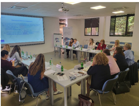
Day two at the Training Centre Plandiste, Plandiste, Serbia

This two-day activity laid a strong foundation for ongoing collaboration, the exchange of best practices, and the organization of joint training sessions. To build on this momentum, it is crucial to continue establishing a network among regional migration training centers, aligning efforts to achieve project goals.