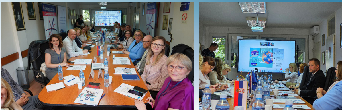
Day one at the Commissariat for Refugees and Migrations of RS, Belgrade, Serbia