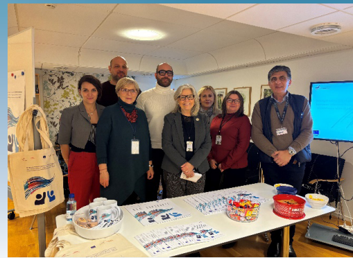
10 December, Norrköping, Sweden

On the following day, a Project Coordination Team meeting was held with the participation of project partners and beneficiary institutions. During the meeting, participants reviewed the project's progress and planned future activities and coordination efforts. They discussed 16 priority training topics for the development of training programs aimed at beneficiary institutions in the Western Balkans, considering plans for their implementation. The team also explored the most effective modalities for these training programs to ensure they would be beneficial for the entire Western Balkans region.