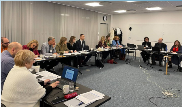
Project Coordination Team meeting, 11 December 2024